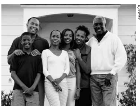
Boston Community Loan Fund provides loans to community development corporations to rehabilitate one- to four-family buildings in the greater Boston area for first-time homeowners.

By accepting market or belowmarket returns, investors in these community vehicles put even more money to work, creating affordable housing, jobs, and critical services.