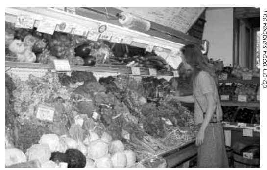
A shopper inspects the produce at the People's Food Co-op.

"Talking about ShoreBank is an easy subject for me," added Staples. "I just can't say enough good about it."